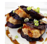
百花釀茄子 Stuffed Egg Plant 5.95