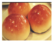
叉燒焗餐飽 Baked BBQ Pork Bun 4.95