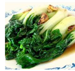
清炒小白菜 Stir Fried Baby Bok-Choy