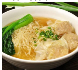
雲吞湯麵 Wonton Noodle Soup