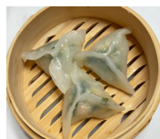
鮮蝦韭菜餃 Shrimp & Chives 5.95