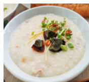
皮蛋瘦肉粥 Pork Porridge 8.95