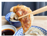
菜肉香鍋貼 Pot Stickers 4.95