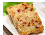
臘味蘿白糕 Turnip Cake 4.95