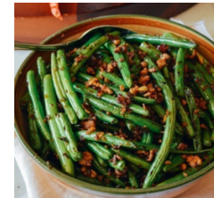
乾扁四季豆 Stir Fry Green Bean