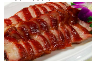
蜜汁叉燒 BBQ Pork