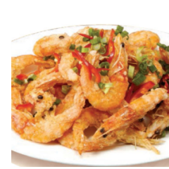
椒鹽中蝦 Salt & Pepper Shrimp