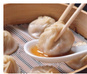
上海小籠飽 Shanghai Soup Dumplings 5.95