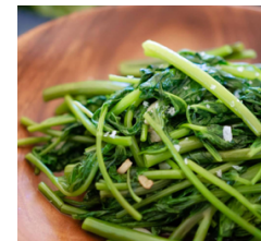
通心菜 Water Spinach