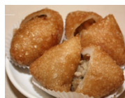
五香鹹水角 Minced Meat Turnover 4.95