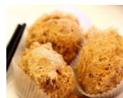
蜂巢荔芋角 Fried Taro Root Puff 4.95