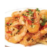
椒鹽中蝦 Salt & Pepper Shrimp 12.95