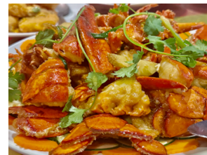
港式龍蝦 Cantonese style Lobster