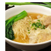
雲吞湯麵 Wonton Noodle Soup 12.95