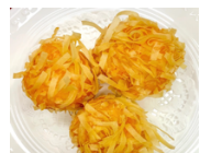
黃金炸蝦丸 Fried Shrimp Ball 5.95