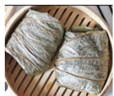
荷香珍珠雞 Sticky Rice in Lotus Leaf 5.95