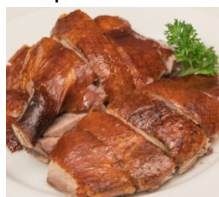
明爐燒火鴨 Roast Duck