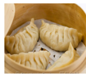
素菜餃 Steam Veggie Dumpling 4.95