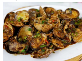
鼓汁炒見 Clam with Black Bean Sauce