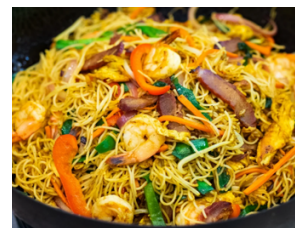
豉油皇炒麵 Soy Sauce Pan Fried Noodle