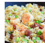
揚州炒飯 Yeung Chow Fried Rice 13.95