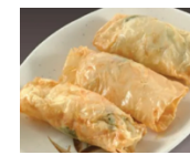
脆皮蝦春卷 Spring Roll With Shrimp 5.95