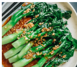
蠔油芥蘭 Chinese Broccoli w Oyster Sauce