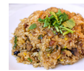
生炒糯米飯 Stir Fried Sticky Rice 5.95