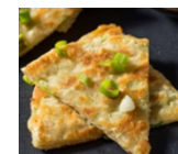
家鄉蔥油餅 Scallion Pancake 4.95