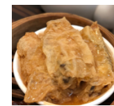
蠔皇鮮竹卷 Bean Curd Meat Roll 5.95