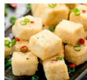
椒鹽豆腐 Salt & Pepper Tofu 10.95