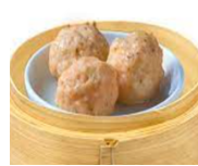
蛋白蒸蝦丸 Steam Shrimp Ball 5.95