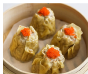
北菇燒賣仔 Pork Sui Mai 5.95