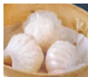
晶瑩鮮蝦餃 Shrimp Dumpling 5.95