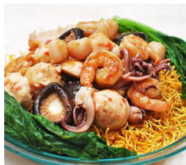
海鮮炒面 Sea Food Pan Fried Noodle