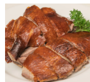
明爐燒火鴨 Roast Duck 14.95