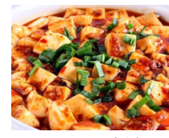
Mapo Tofu 麻婆豆腐