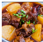
牛腩萝卜 Beef Turnip Bowl 9.99