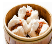
蜜汁叉燒飽 Steam BBQ Pork Bun 4.95