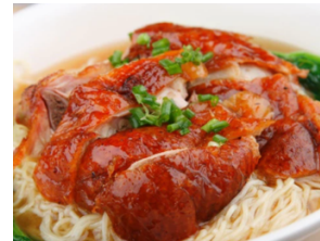
燒鴨湯面 Roast Duck Noodle Soup