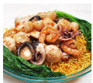
海鮮炒面 Seafood Pan Fried Noodle 18.95