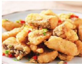
椒鹽魚柳 Salt & Pepper Fish Fillet